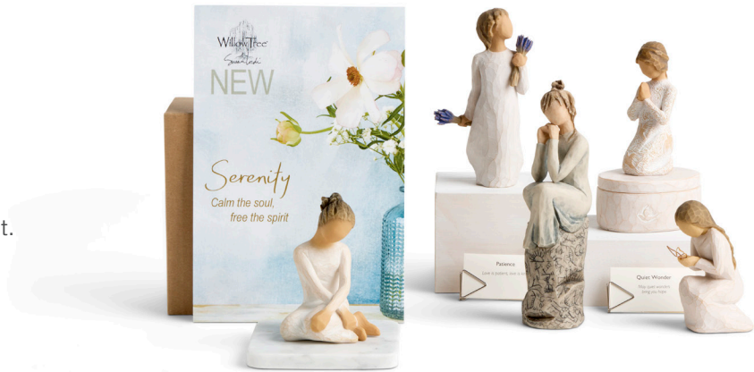
261043 NEW Easel Sign

Featuring Serenity with pieces of similar sentiment gives consumers purchase options.