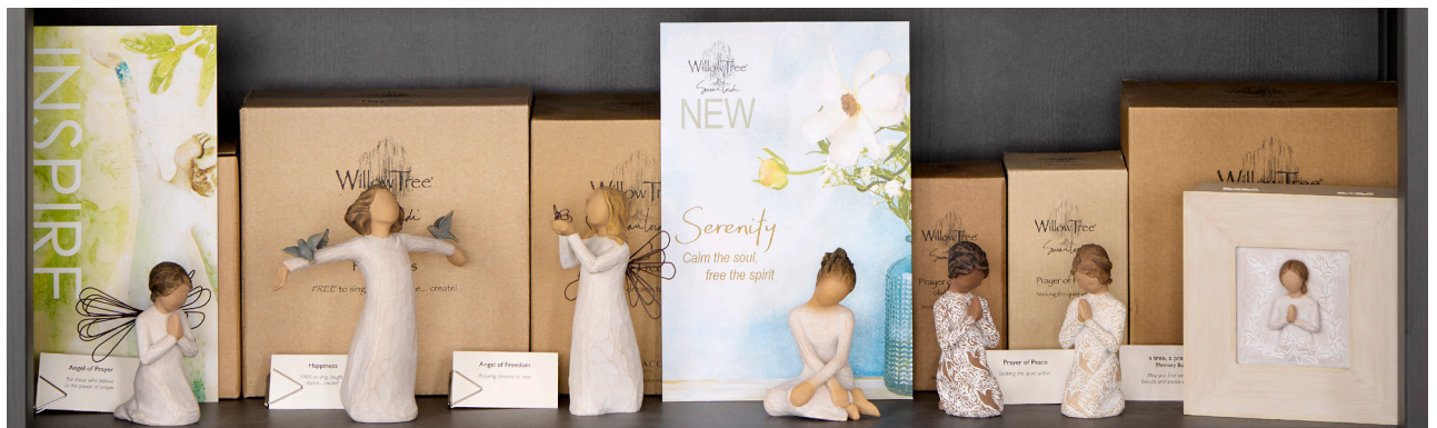
26012 Angel of Prayer